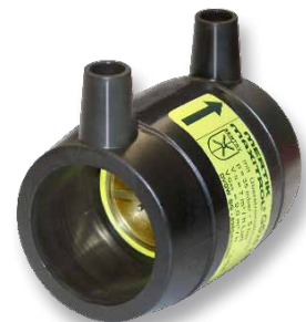
SENTRY GS in an electro fusion coupler