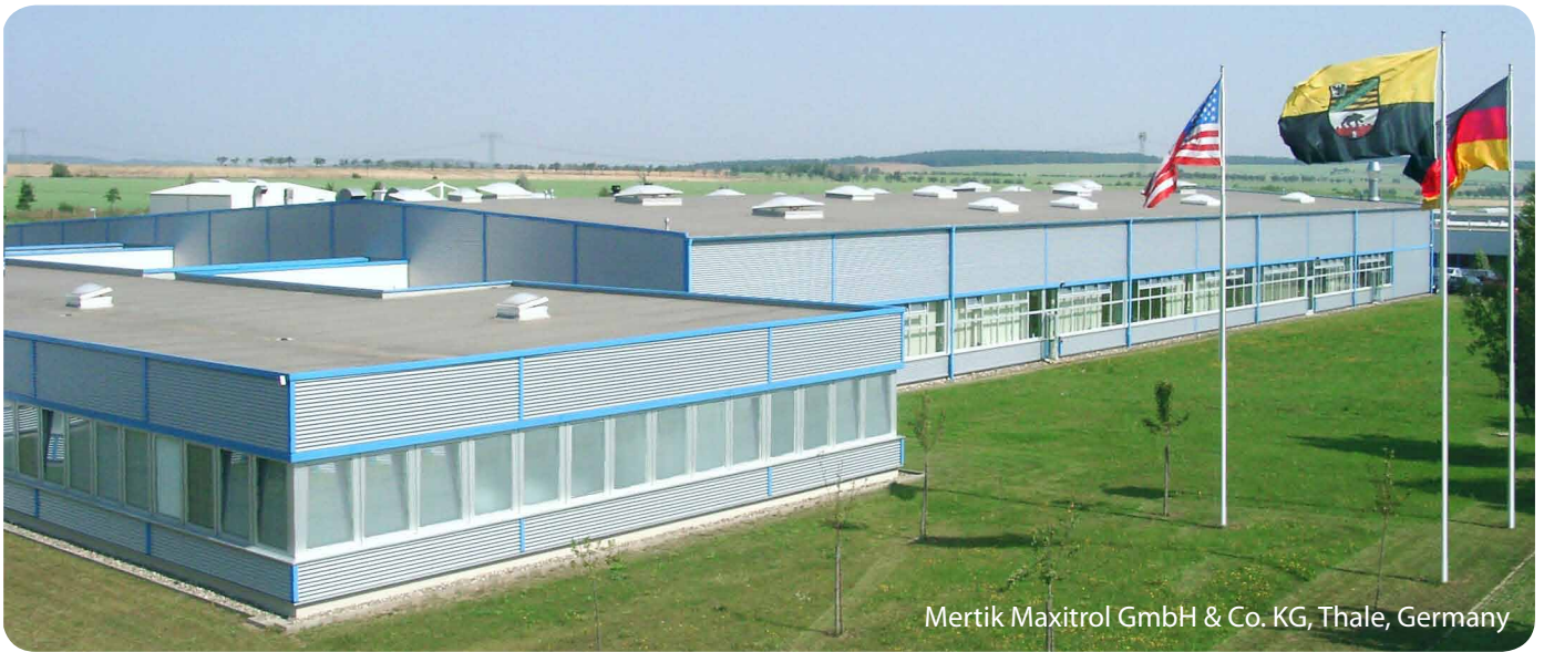
Mertik Maxitrol GmbH & Co. KG, Thale, Germany