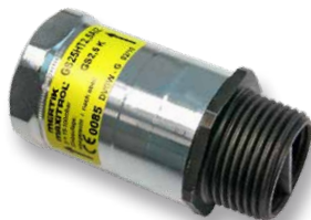
SENTRY GS with a thermally activated shut-off device