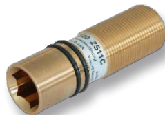
SENTRY GS for underground gas service lines