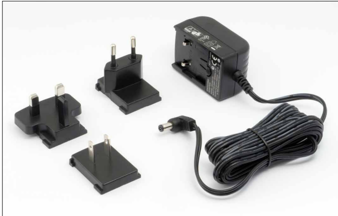
Figure 1: G60-ZMA3 contents

Do NOT use a product if you suspect it has been subjected to high temperatures, damaged, tampered with, or taken apart.